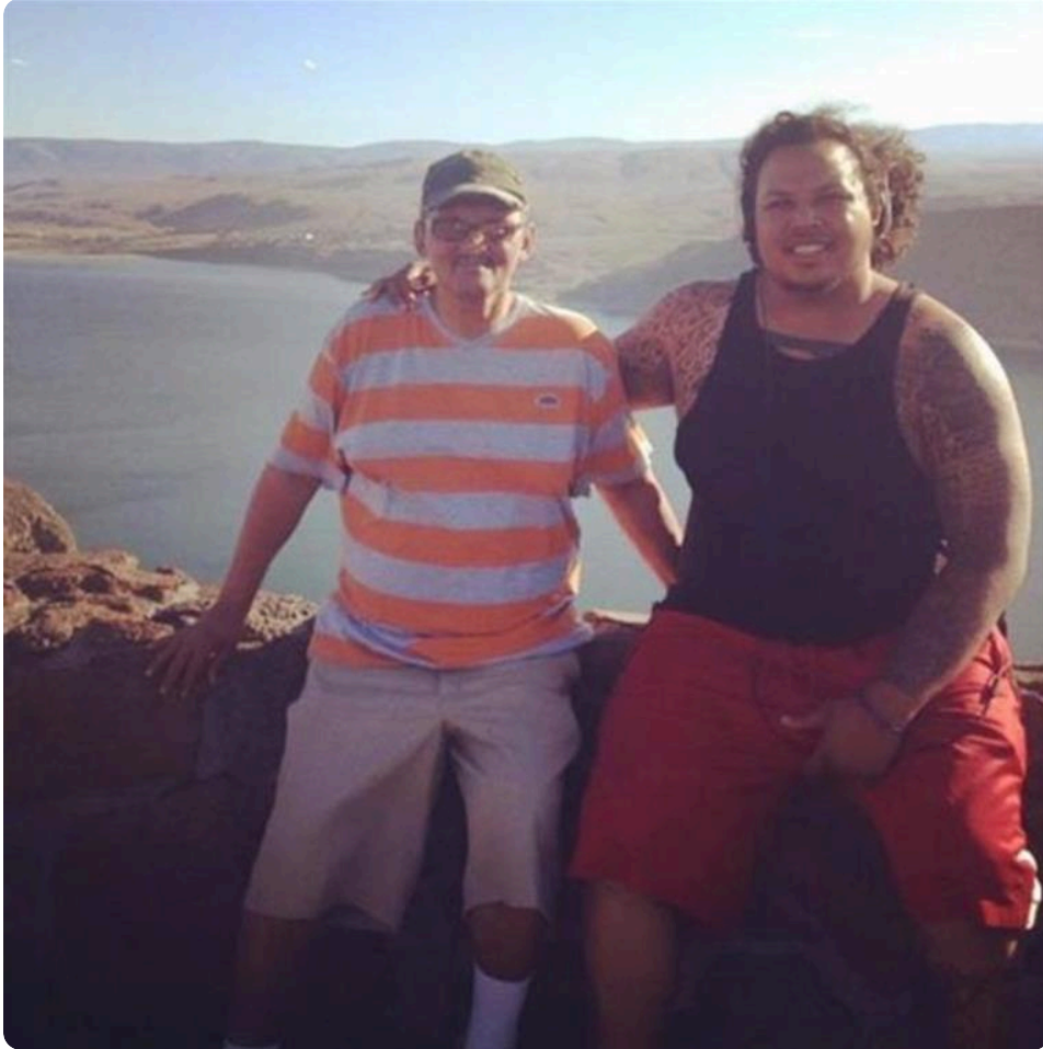
"Theo was loved and Theo loved"