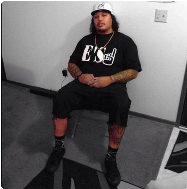
"Rest in the arms of the angels"