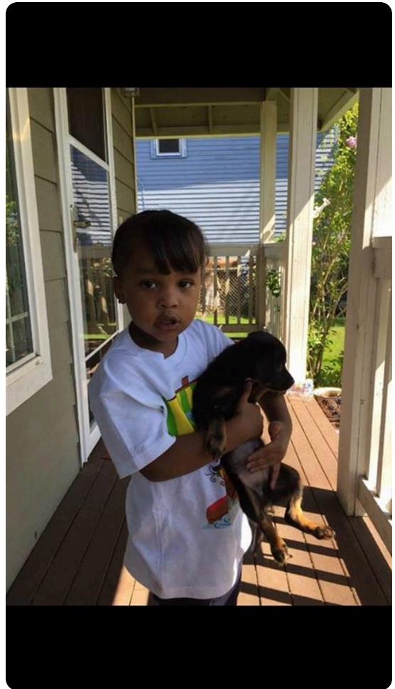
"Theo was loved and Theo loved"