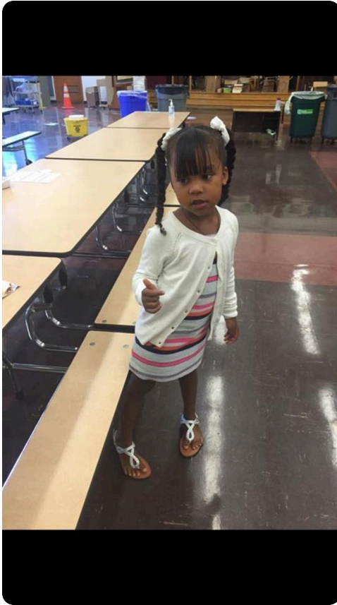
"Theo was loved and Theo loved"