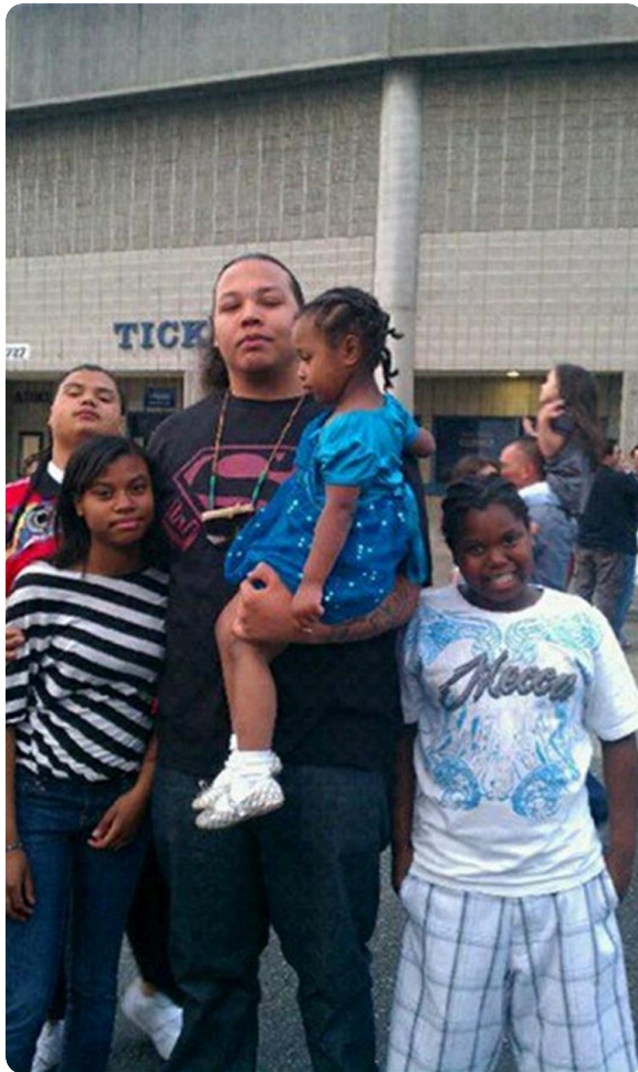
"Theo loved and Theo was loved"